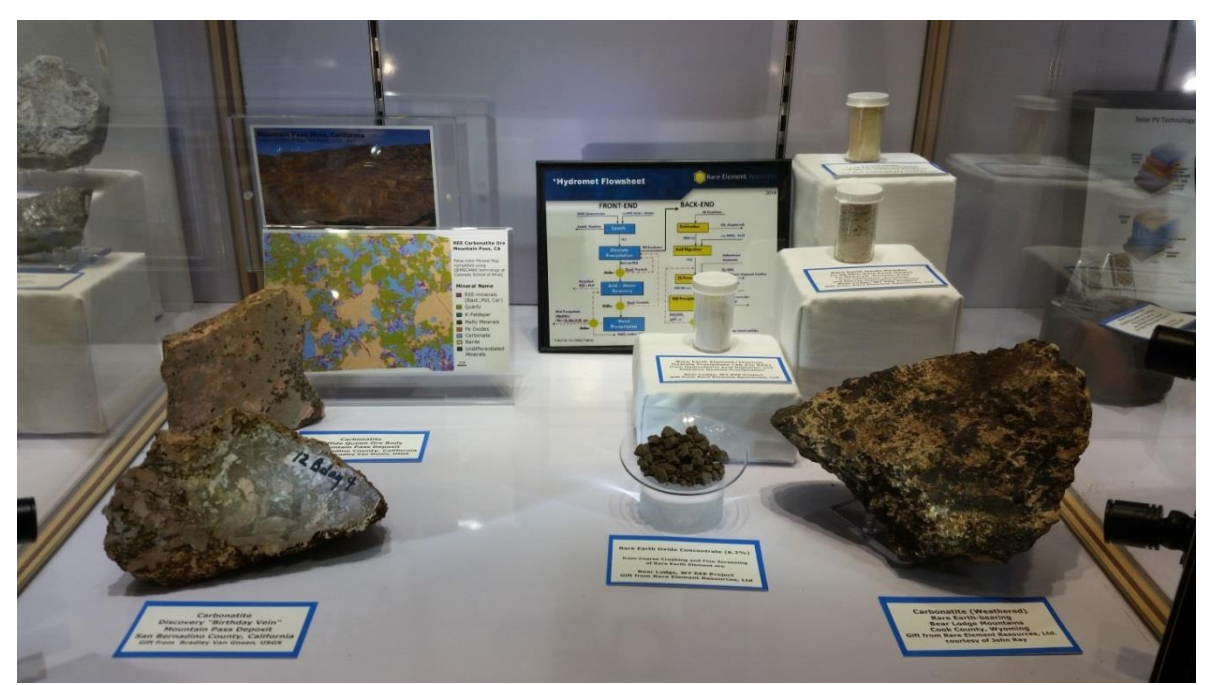
Figure 4. Ore samples from the Mountain Pass, CA rare earth mine (donated by USGS, Brad Van Gosen) and ore samples and metallurgical testing samples from the Bear Lodge, WY rare earth deposit (donated by Rare Element Resources).

The exhibit was able to come to life only from the many contributors who have given items for display along with their time and expertise. An estimated 88% percent of items on display were donated, loaned or already in the museum's collection (Appendix B). Over 120 hours of expertise were given from volunteers and partners (Appendix A). All donors and volunteers were recognized at the "soft" and "grand" opening receptions, and all donated items on display show acknowledgement of the gift or loan from the donor (Appendix B). The estimated total cost of the exhibit is valued at $87,313; of which $29,508 of donated goods, donated time and expertise, and discounts are included. This does not include the time and/or salaries of the three exhibit developers. Both totals are conservative amounts, given that the values of 31 out of 71 donated and loaned items plus some specimens from the museum's collection are unquantifiable; these are priceless, one-of-a-king materials, and include such items as ore samples (Fig. 4), research samples (Fig. 5a, b), metallurgical samples (Fig. 4), demo phones (Fig.6), and dead batteries (Fig. 6). In many instances, these items can only be attained from strategic partnerships.