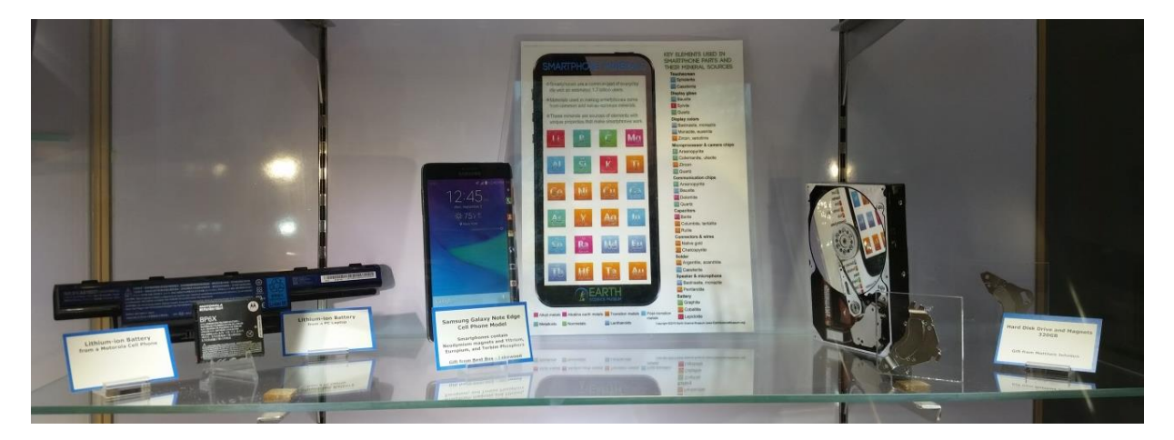
Figure 6. Advanced technology and energy storage items, all were donated for the exhibit.