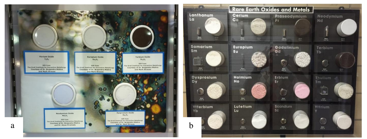
Figure 8. (a) Rare earth oxide powders on display in the CSM Geology Museum Critical Materials Exhibit. (b) Rare earth oxide powders on display at Ames Laboratory.

collection. The box is a type of exploration lab/field equipment for viewing petroleum inclusions under white and longwave UV light. The lab/field equipment box was a perfect way to show off the phosphorescent/luminescent qualities of the phosphors (Fig. 9) used in CFL bulbs. This system also added an interactive component to the exhibit.