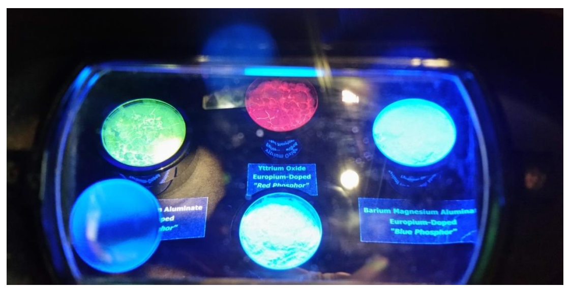
Figure 9. The view when looking into the phosphor viewing box. This photo shows the rare earth-doped phosphors illuminated with longwave UV light. Note that the obstruction on the bottom left of the image is from a built-in magnifying lens and is not present when actually viewing in-person.

Figure 8. (a) Rare earth oxide powders on display in the CSM Geology Museum Critical Materials Exhibit. (b) Rare earth oxide powders on display at Ames Laboratory, courtesy of Dr. Vitalij Pecharsky.