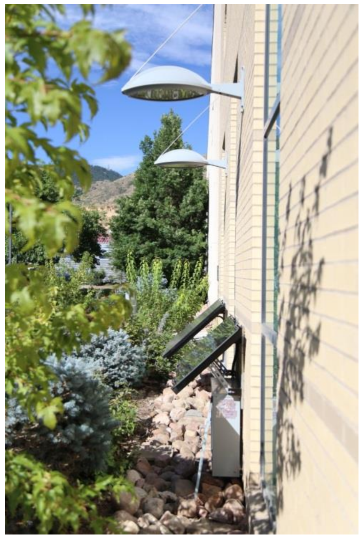
Figure 2. Critical Materials exhibit solar display at CSM Geology Museum, with a CdTe panel in the foreground and a CIGS panel in the background. These panels power a portion of the Critical Materials exhibit inside the museum.

With new additions to the exhibit since the Grand Opening, the response from museum visitors continues to be overwhelmingly positive. The presence of the exhibit in the Geology Museum has spurred much conversation with museum guests regarding critical materials. Students of all ages and backgrounds can appreciate the many aspects of critical materials in their daily lives, making the university setting a perfect location for such an exhibit (Fig. 3). The story surrounding critical materials and advanced technologies continues to unfold with every visit.