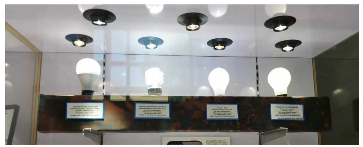
Figure 6. The importance of critical materials in energy efficient lighting (CFL's and LEDS) demonstrated in the "product" case. The role of developing substitutes, like LED bulbs which are more energy efficient than CFL's and use fewer rare earth elements, is one of CMI's research thrusts.